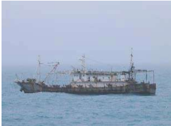
g. Photographs - Photos taken at 10:46 on July 15, 2020