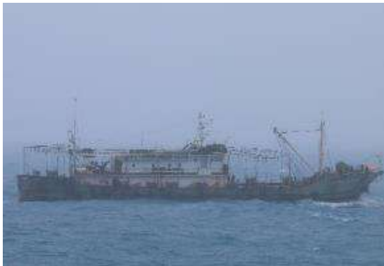
g. Photographs - Photos taken at 10:15 on July 15, 2020