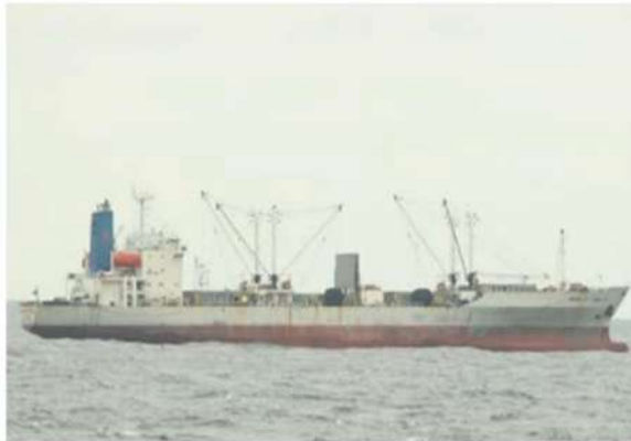
Photos taken at 7:43 (JST) on September 6, 2021