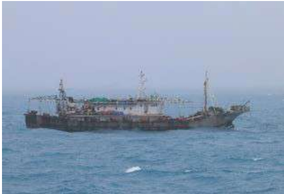
g. Photographs - Photos taken at 11:14 on July 15, 2020