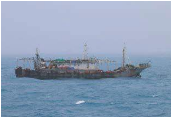
g. Photographs - Photos taken at 11:14 on July 15, 2020