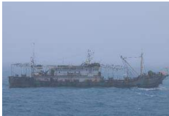
g. Photographs - Photos taken at 10:15 on July 15, 2020