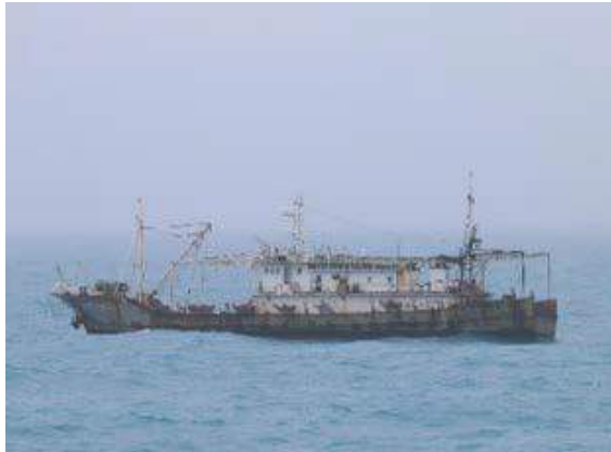
g. Photographs - Photos taken at 10:46 on July 15, 2020